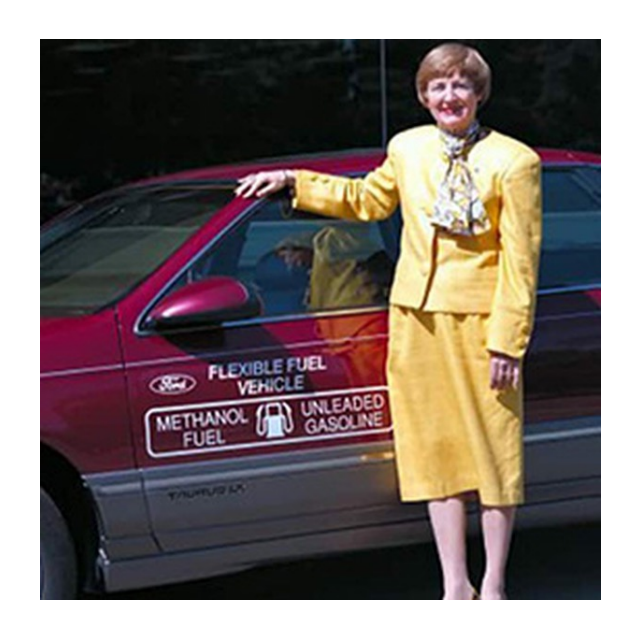
Throwback: Need for Speed Sets Alternative Fuels Pioneer on Career Path One of Ford's leaders in alternative fuel research actually got into the field...