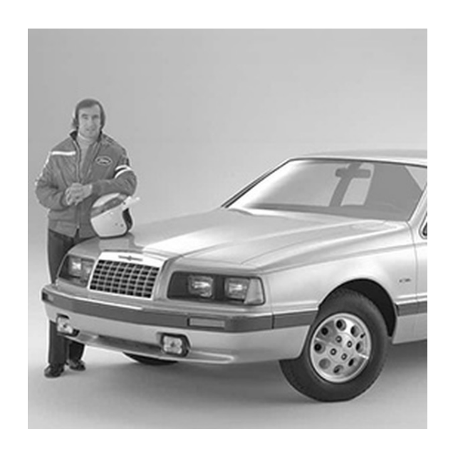
Throwback: New Aerodynamic Design Gets T-Bird Flying Again

The Ford Thunderbird has a storied legacy, but by the early 1980s, sales had dipped drastically.