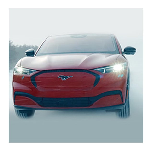
Video: How to Maximize Your Range in Cold Weather

All electric vehicles experience a decrease in range during cold temperatures.