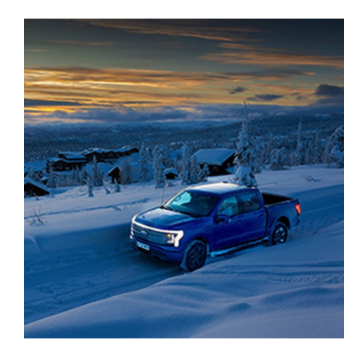
It's Official - Ford F-150 Lightning is Coming to Europe

The company selected Norway as the first country to take the all-electric pickup global.