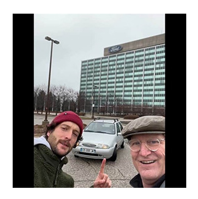
Film Director Brings Fiesta 'Home' for Documentary Filming in Detroit

A filmmaker from France has reunited the car with its "hometown" as a way to honor his grandfather.