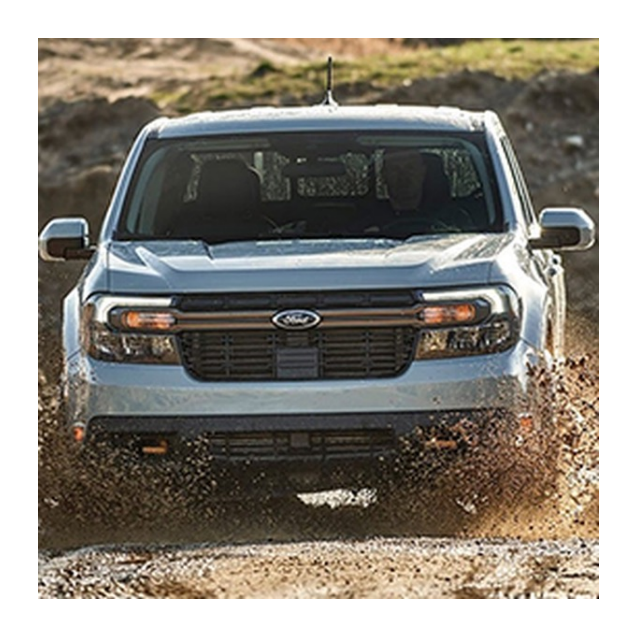
What They're Saying: Maverick Tremor Drive Impressions

Ford loaned select media the 2023 Maverick Tremor to get their impressions.