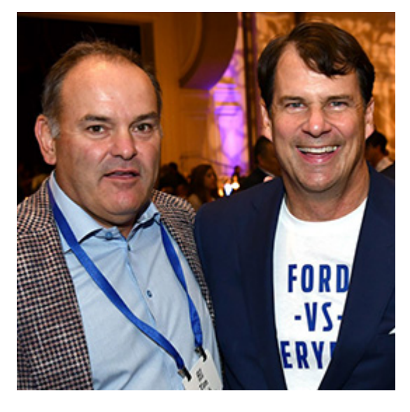
Ford and Dealers Join Forces to Invest, Grow and Focus on