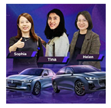
The "Iron Women"