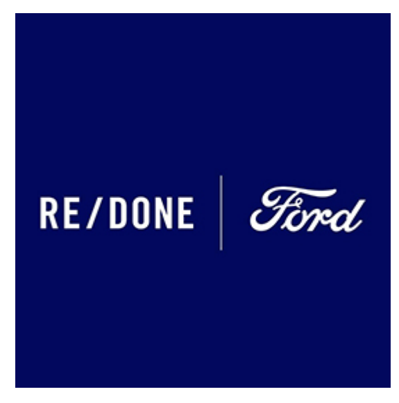
Fashion Gets a Charge From F-150 Lightning The RE/DONE x Ford capsule