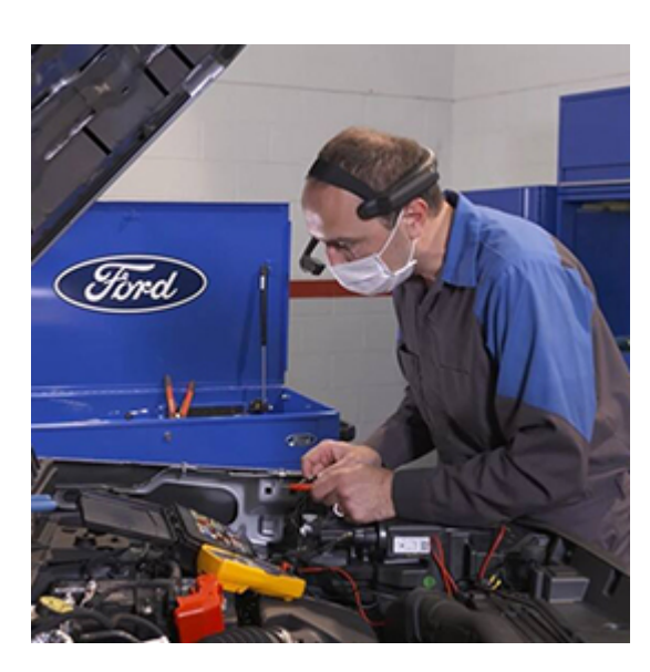
Remote-Assistance Technology to Help Get Customers Back on the Road Quicker

Ford Manufacturing Teams Celebrate Juneteenth »