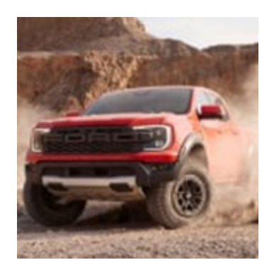
Next-Gen Ranger Raptor Rewrites the