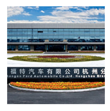
Changan Ford Hangzhou Plant