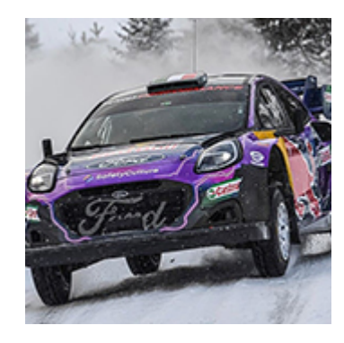
Watch M-Sport Ford in Action in Sweden