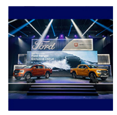
Next-Gen Ranger Launched Across Asia Pacific Distributor Markets