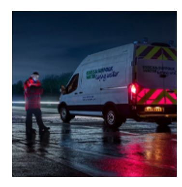
Ford Helps Roadside Workers Stay Safe with Pioneering Illuminated Rear Panels for Vans Ford trialed the panels in collaboration with Northumbrian Water