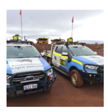
Ford Works with Local Mining Company to Create Autonomous Rangers in Australia The Rangers have been