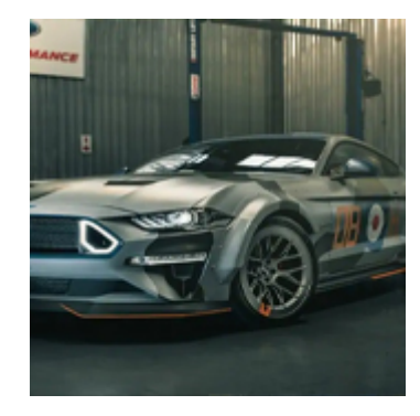
Unique Mustang Helps in Restoration of Iconic Spitfire Aircraft The last remaining Spitfire warplane in South Africa took a step closer