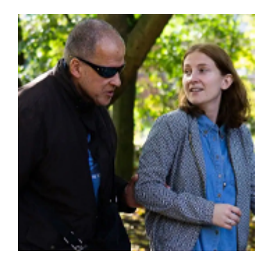
Spin Partners to Educate E-Scooter Riders on Disabled Pedestrian Safety Through the partnership, Spin's e-scooter riders