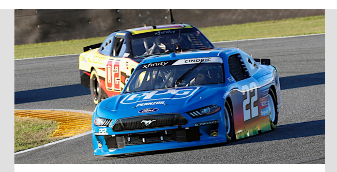
How to Watch Ford Performance Racing this Weekend »